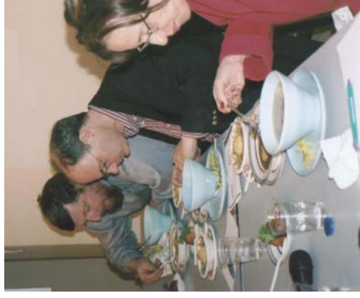
Judging the matzo balls at the Iron Koshar Chef