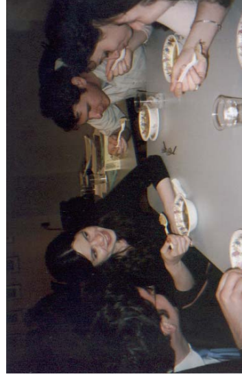
Tasting the results at the Iron Kosher Chef

Come celebrate our teachers' devotion to education with this special event. All of our teachers are volunteers and we thank them for their commitment to learning, Judaism, and the Study Center.